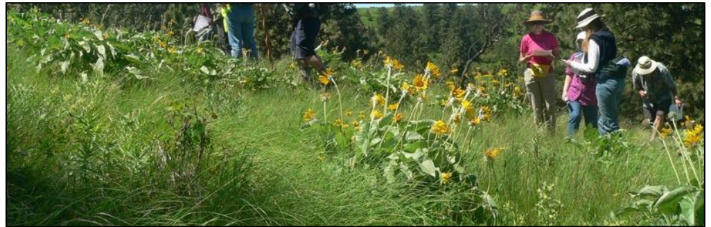
Helping to preserve and learning to restore Palouse Prairie