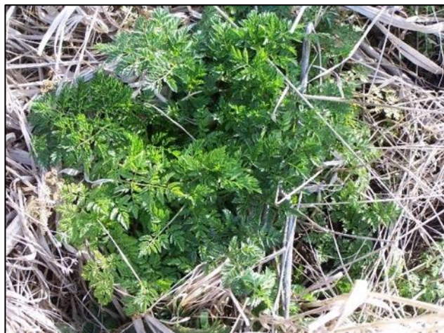
Young poison hemlock ( Conium maculatum ) has fern-like leaves that assist in identifying the young plants.

Poison hemlock can be seen along roads, bordering pastures, agricultural fields, and streams. The plant is not native to the Americas and can be distinguished from the native (and also toxic) water hemlock by the purple spots on its stems. Poison hemlock grows 6 to 8 feet tall, branching extensively into fern-like leaflets. It develops white flowers in umbrella-shaped clusters. It emerges early in the Palouse spring and is best managed as soon as it can be identified by its characteristic leaves.