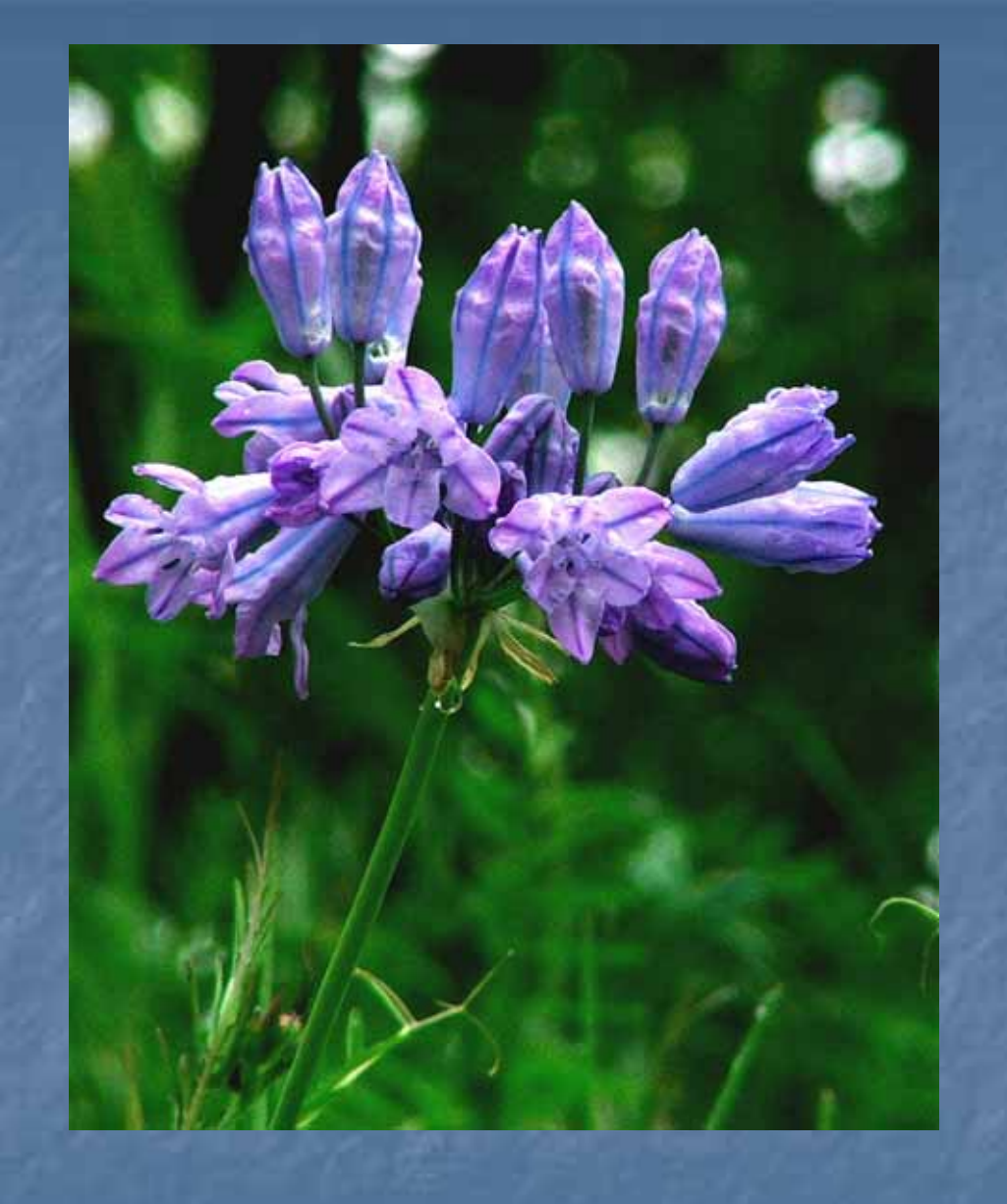
Red Besseya and Wild Hyacinth