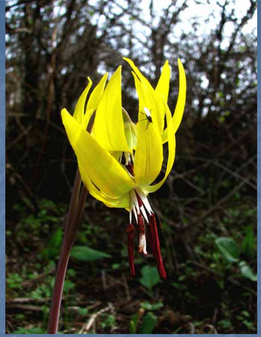
Sagebrush Buttercup and Trout Lilly