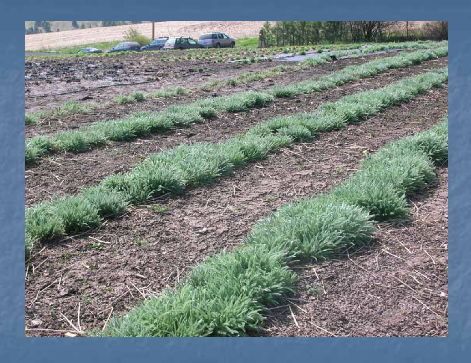
Seed Increase Plot of Native Palouse Prairie Wildflowers