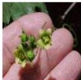
Bryonia alba flowers.