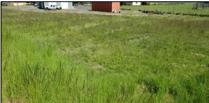
May 26, 2021, the west half of the Crock Garden, still green