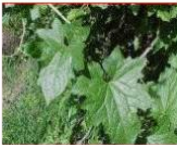
Bryonia alba leaves.