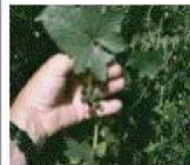
Bryonia alba leaf and berries.