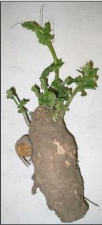
Severing the bryony vines is ineffective because the bryony plant grows back from the root.

This photo shows a Bryonia alba that was found popping up through a stream restoration site at the South Fork of the Palouse River along Palouse River Drive just south of Moscow on April 17, 2004. It resembles a cow parsnip in its young stage at first glance (similar color and size), but obviously different with the hairy stems and leaves, multiple stems, tendrils, etc. The root segment in this photo is 9 inches long, 4 inches in diameter at its widest point, and weighs 1.125 pounds.