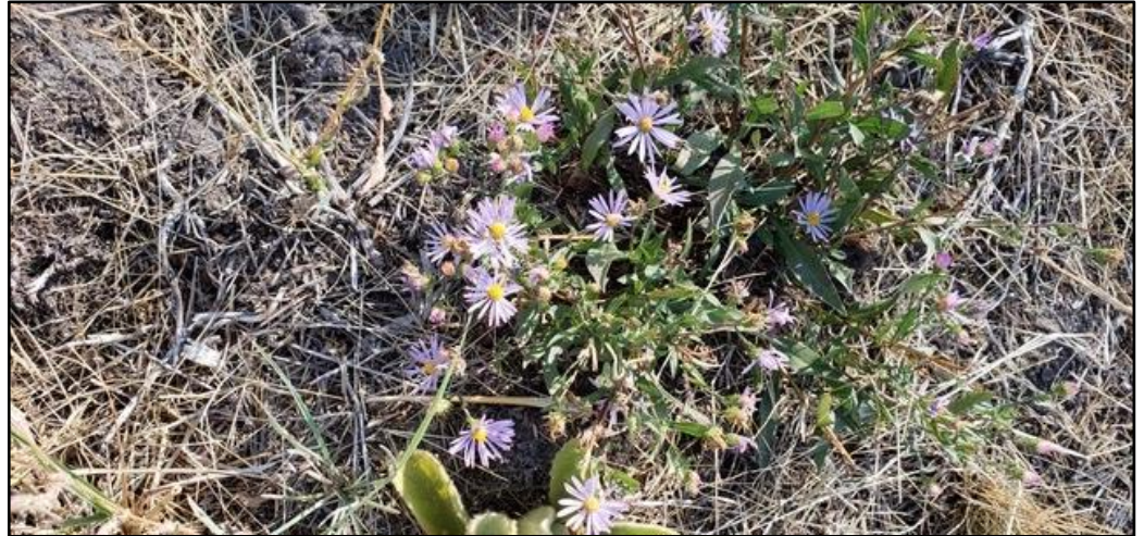
Western asters welcoming fall at the John Crock Pollinator Garden

The transition from summer to fall is starting. Mornings are brisk. Daylight is relinquishing itself to the night. Rosehips are ripening. The fall-blooming natives such as goldenrods and asters are showing their colors before frost arrives. There is still a bit of time to get out and enjoy the native ecosystems and time to attack the invasive weeds that challenge them. This month we have provided an in-depth article on Bryonia alba to help you understand why this plant is so harmful and so difficult to eradicate.