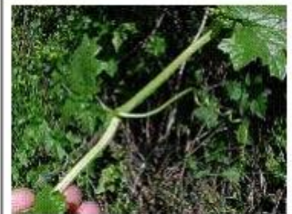
Bryonia alba stem and tendril.