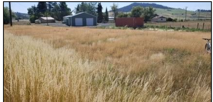
July 6, 2021, west half of site, very dry after the heat wave

The PPF board decided to spread seeds of native Palouse Prairie wildflowers this fall, as soon as we (hopefully) get some rain. We will focus the seeding on the intermittent strips of sparse grass and lots of bare soil that apparently were missed when we spread grass seed in the fall of 2019.