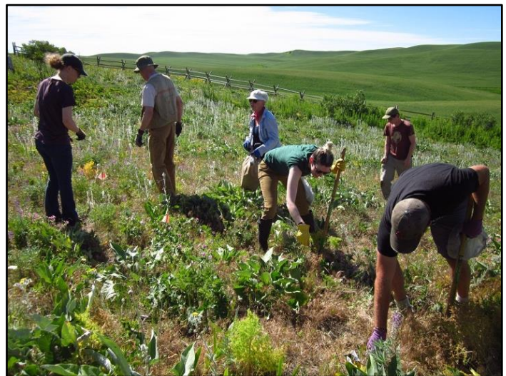
Pulling weeds to let the prairie flourish