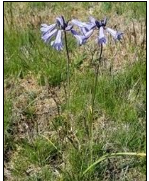
May 26, 2021, a native wild hyacinth, Triteleia grandiflora